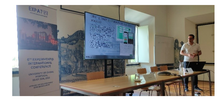
Photos from "Smart Industry & Sustainability" session presenting KYKLOS 4.0 solutions and achievements.